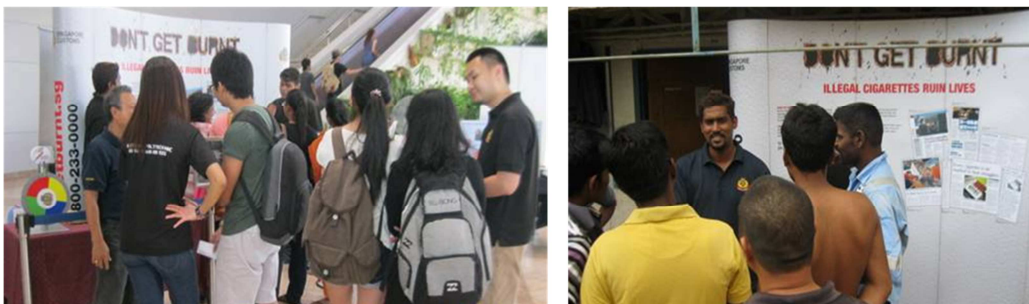
Singapore Customs officers conducting talks and road shows in schools and foreign worker dormitories.

Singapore Customs maintained its active public outreach and engagement last year. Over 200 anti-contraband cigarette talks and road shows were conducted at places such as schools, transportation and freight-forwarding companies, and foreign worker dormitories. Besides raising public awareness about contraband cigarettes, these outreach sessions also educate the public on how they can help to be our “eyes and ears” on the ground and report contraband cigarette activities they encounter to Singapore Customs.