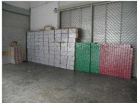
Contraband cigarettes uncovered inside the bonded trucks