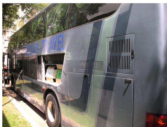
Double decker tour bus used for conveying the contraband cigarettes